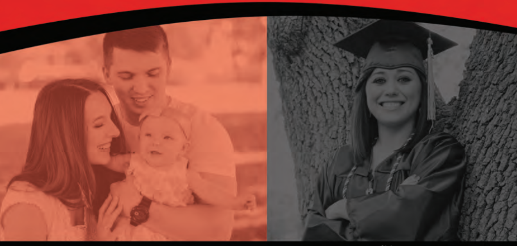
THE RELATIONSHIP OF A LIFETIME<sup>SM</sup>