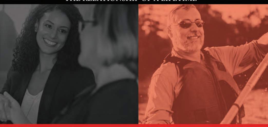
2018 ANNUAL REPORT